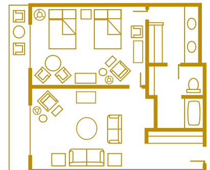
Typical 1-Bedroom Suite with 2 queen beds and 1 day bed, 760 Sq. Ft.