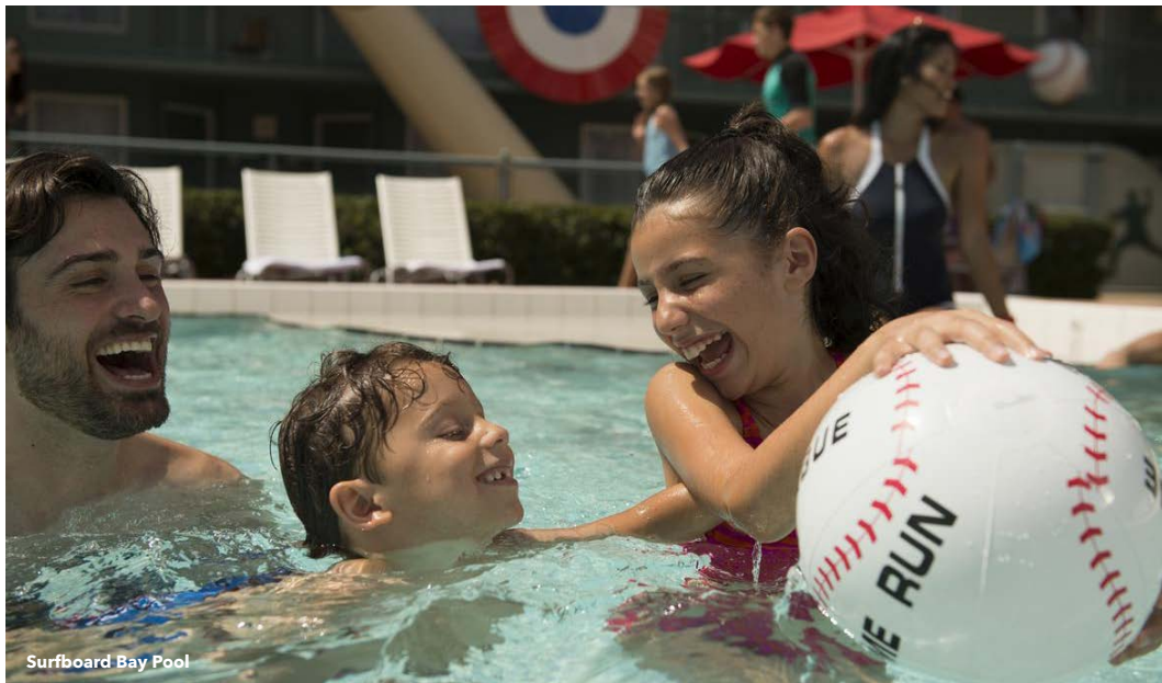
Surfboard Bay Pool