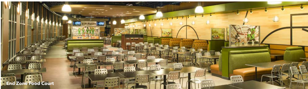
End Zone Food Court